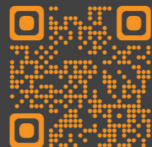
Healthbridge Nova Web page