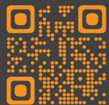
Healthbridge Nova Launch Video

Email: sales@healthbridge.co.za | Web: www.healthbridge.co.za