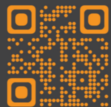
Healthbridge Nova Features Video